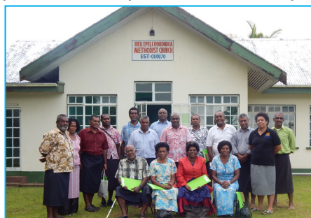
Translators & Reviewers Team after the final proof-reading session in front of the Rev. Epeli Rokowaqa Methodist Church in Maumi village.