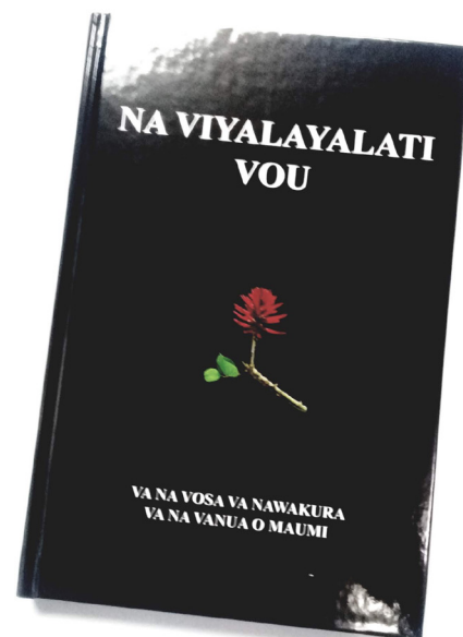
The New Testament in the Maumi dialect.