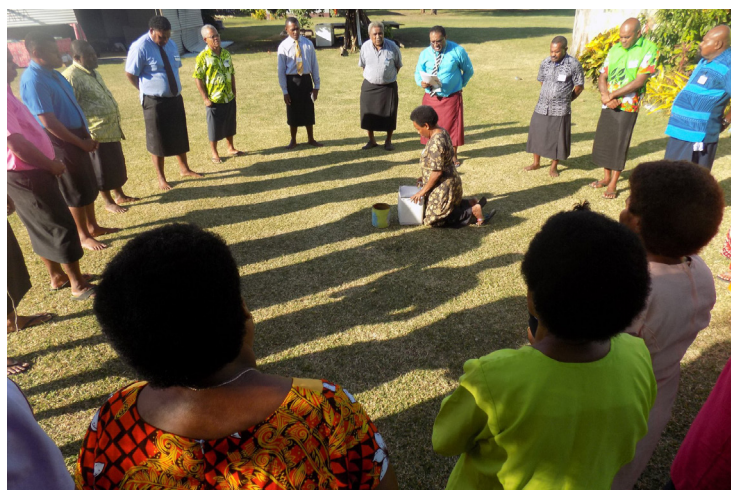
Taking Your Pain to the Cross at the Trauma Healing workshop at Bukama village.