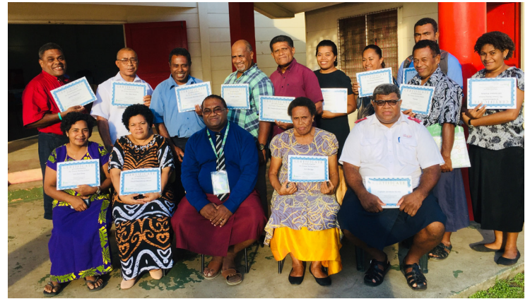
Graduate Apprentice Facilitators from the Labasa Trauma Healing Facilitators Training.

Trauma Healing Facilitators training and were certified as ‘Apprentice Facilitators’ during the Bible Week.