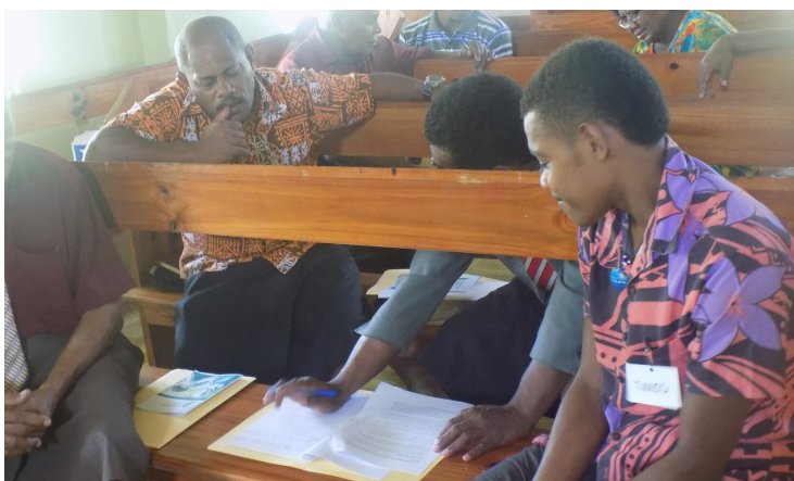
Group discussions at the Trauma Healing workshop in Nacula village.