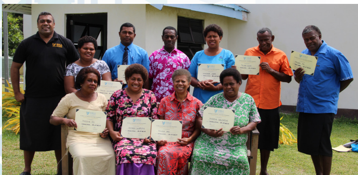
Teachers trained at Tamusua.

of their resource materials to help them teach their Sunday school classes.