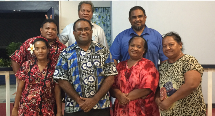
NCC Council Members at the first meeting on Friday 27/9/19

would result in the Nauru Bible to be freely available and accessible through smart phones, tablets, and computers for the community in Nauru and abroad.