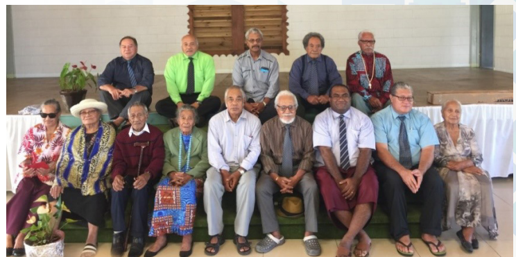
EKN Execs & Church Leaders at the meeting in Alofi

The Ekelesia Kelisiano Niue is very supportive of the idea of putting their Bible under the United Bible Societies' Digital Bible Library program so that the Word of God in the Niue language can be easily available and accessible through the people's smart phones, tablets, and computers wherever they are located. Once the Bible is made available electronically, this opens the door to the development of further scripture products such as the Scripture-Audio Bible and Bible products in different formats (compact, large print, pulpit-size, etc.). The digitization process begins with the scanning of the Niue Bible and followed by the proofreading of the scanned Bible by the Church to remove any typo error that might be on the scanned version. This partnership with the Bible Society was reconfirmed by the EKN Executives led by the