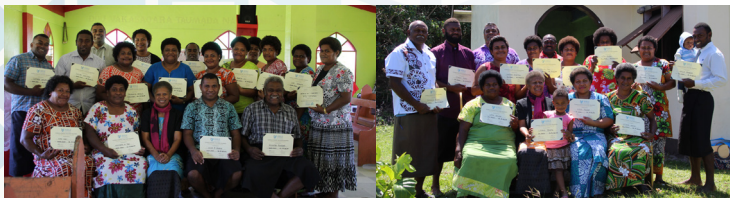
Teachers trained at Bukama.

The first part of the trip was a follow-up trip to the already visited Naviti Island and Nacula, to distribute the certificates of those teachers who were trained in our first visit in May. Also on the agenda was to deliver some